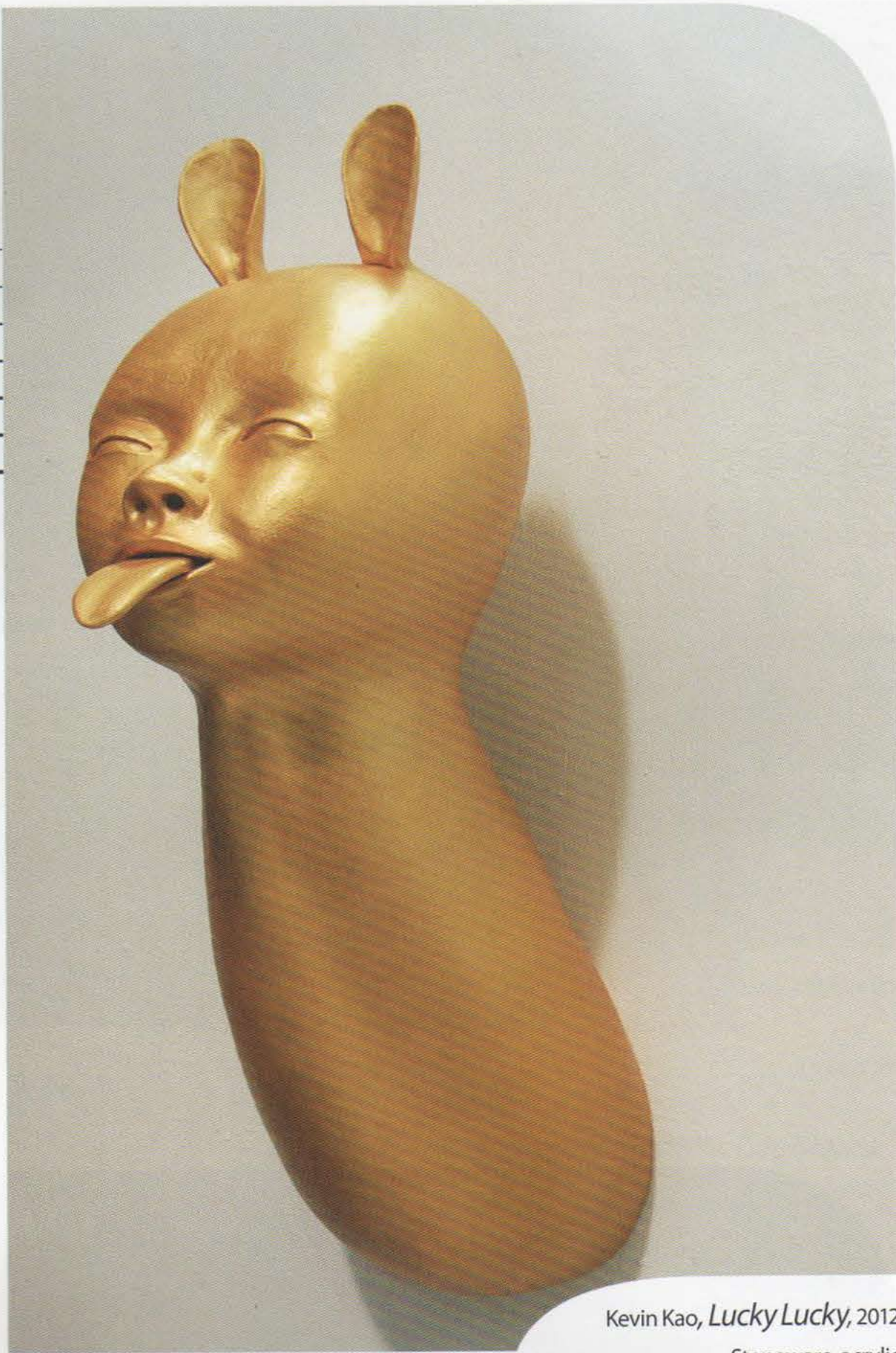
Kevin Kao, Lucky Lucky , 2012 Stoneware, acrylic 28" x 10" x 15"